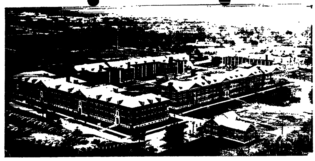
View of buildings in area assigned to ASA School at Fort Devens

ers. Guest houses on the Post are available for visitors.