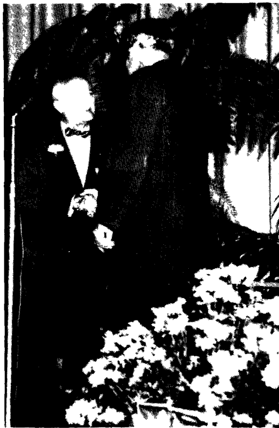
Mr. Friedman receiving the National Security Medal from Mr. Allen Dulles, Director of Central Intelligence

His inventions and many achievements won for Mr Friedman the nation's highest awards and a reputation as one of the world's leading cryptologists. In 1944 he was presented the War Department's highest decoration the