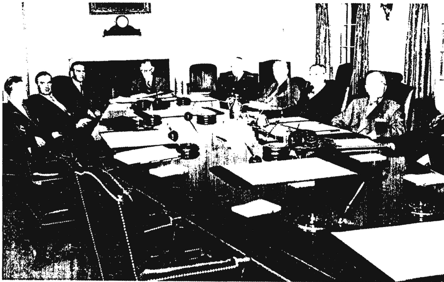
Meeting of the National Security Council, January 1951