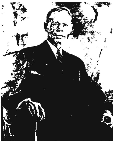
General Walter Bedell Smith, DCI