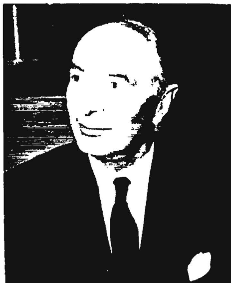
Robert Lovett, Secretary of Defense

With Lovett's memorandum, Canine acquired a new relationship with the military services and their COMINT activities. Theoretically, he now had control over all COMINT collection and production resources. Canine started a four-year term of office as the director of NSA on 4 November 1952. In accordance with its new charter, he received a third star. Each of the services assigned one or two two-star grade officers to the new agency. This change was consistent with Truman's decision to elevate the status of the unified agency. The reorganization of AFSA removed the COMINT structure from exclusive military control and theoretically gave all intelligence agencies, military and civilian, an equal voice in the COMINT processing and requirements process.