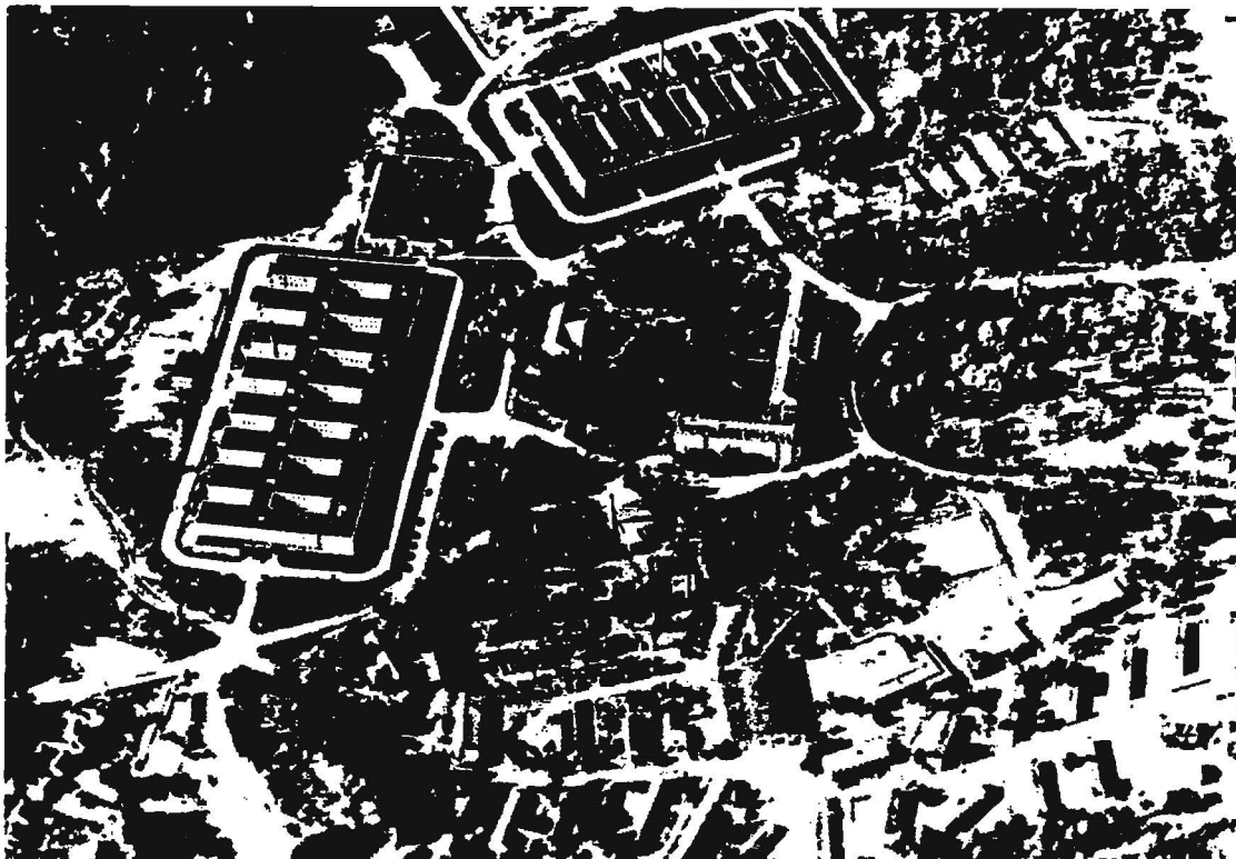
Aerial view of Arlington Hall Station

Coincidental with the negotiations over the allocation of cryptanalytic targets and in anticipation of new and greatly expanded operational missions, each service initiated search actions for the acquisition of new sites to house their already overcrowded facilities. Within one year, the services accomplished major relocations and expansions of their operations facilities within the Washington, D.C., area.