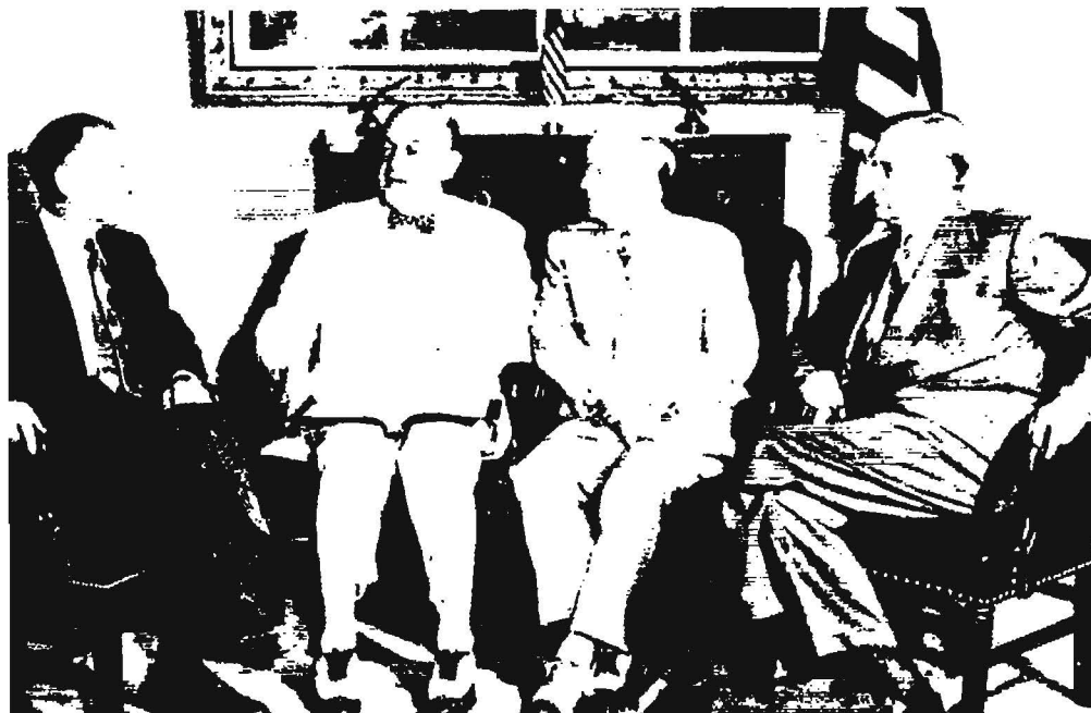
The Johnson Team

Thus, the atmosphere for cooperation and consolidation was volatile. However, by the time the vote on the AFSA merger took place, Johnson had appointed a new Secretary of the Navy, Francis P. Matthews, whom he had selected personally. 29 Matthews supported Johnson's position. As for the Air Force, Vandenberg, as Air Force Chief of Staff, had consistently and actively promoted the growth of the Air Force as an independent service. In addition to the commitment for an independent cryptologic arm for the Air Force, it is also likely that Vandenberg envisaged receiving greater financial support for aircraft programs if he went along with consolidation in other areas such as the merger of cryptologic activities.