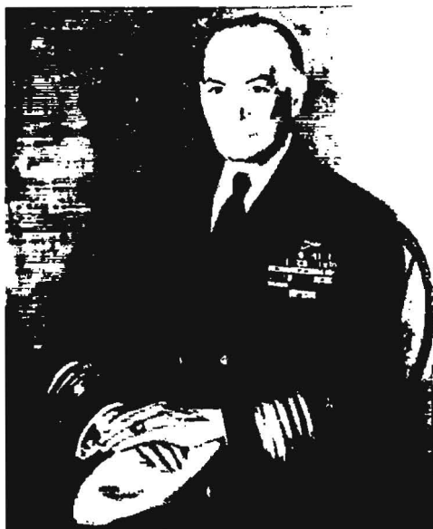
Admiral Roscoe H. Hillenkoetter Director of Central Intelligence