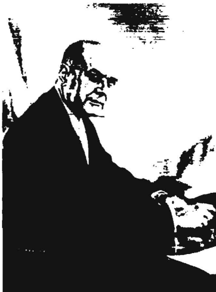
Louis A. Johnson, Secretary of Defense

Over the next three years the Air Force, as an independent service, had a major impact on the Army-Navy COMINT organizations. The establishment of the AFSS indicated that Air Force officials demanded a security service or cryptologic organization equal to the Army or the Navy COMINT structures. Competition for COMINT targets and resources intensified. Moreover, the three services now competed for recruitment of personnel to augment (or replace) the dwindling military competence in COMINT.