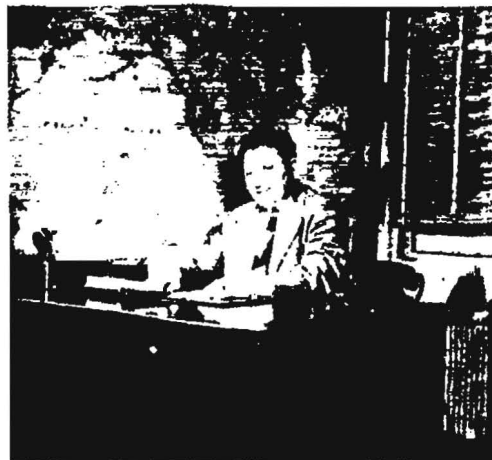
Dr. Solomon Kullback Chief, Research and Development Monitor Group