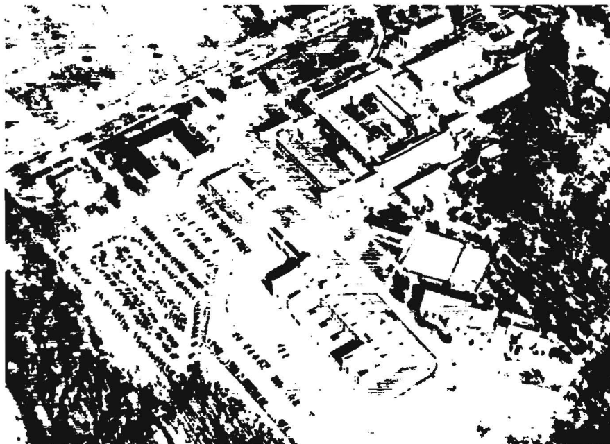
Aerial view of Navy Headquarters at Nebraska Avenue, March 1949