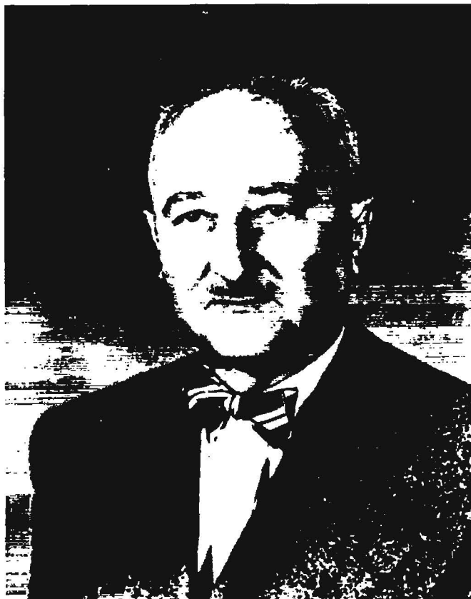
William F. Friedman

The stated fundamental objective of the CONSIDO consolidation plan was to improve Department of Defense intelligence and contribute to "efficiency and economy." With the establishment of CONSIDO, the COMINT exploitation units of all other departments were to be abolished. CONSIDO was to provide integrated intelligence estimates on all available COMINT and was to reflect the joint view of all intelligence agencies. 4 General Joseph T. McNarney, special assistant to the Secretary of Defense, became an enthusiastic supporter