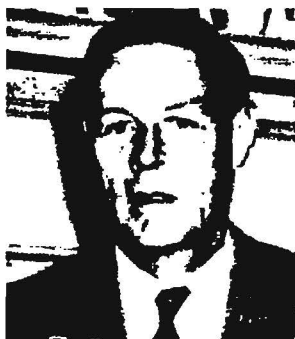
Charles E. ("Chip") Bohlen