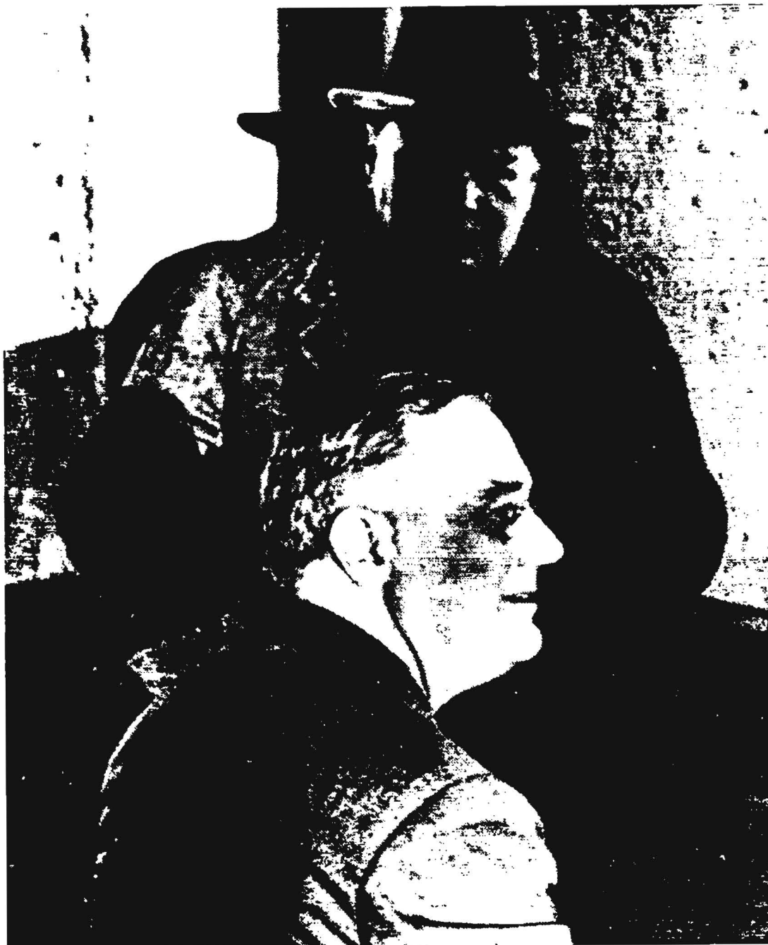
Franklin D. Roosevelt and Winston Churchill established a direct channel of personal communications in 1940, reinforcing strong ties between the United States and Great Britain.