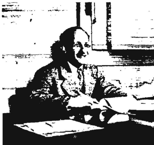
Dr. Abraham Sinkov Chief, Communications Security Monitor Group