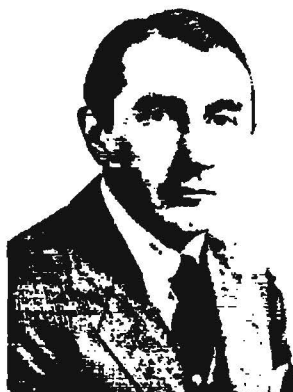
William H. Jackson