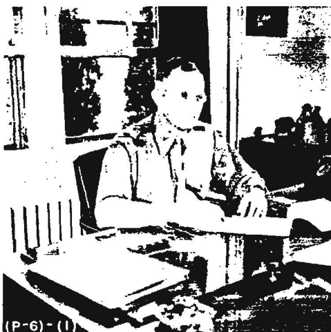
Colonel W. Preston Corderman, USA