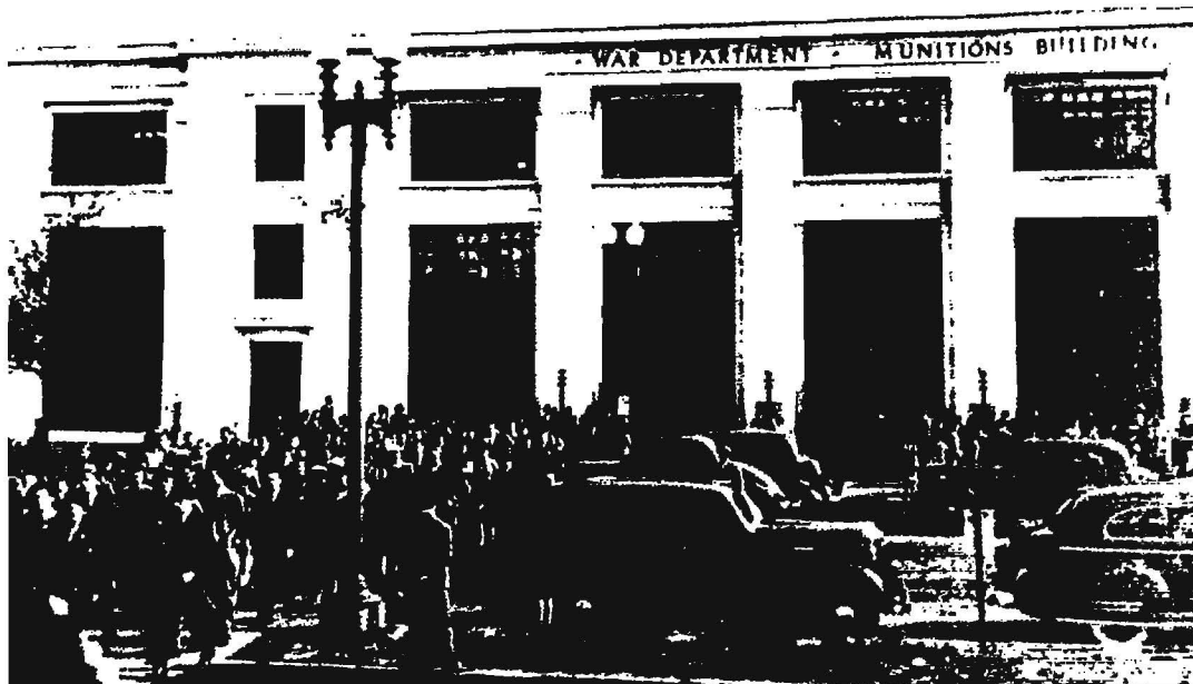
War Department Munitions Building

Leaving nothing to chance in their advance preparations, Army and Navy officials held a number of closed meetings prior to the meeting of the full committee. They sought primarily to resolve their long-standing disagreement on coverage of diplomatic targets. Five days before their meeting with the FBI, the Army and Navy succeeded in reaching an agreement on the division of COMINT responsibilities between their organizations. 21 The solution, urgently promoted backstage, resolved the nagging question of how to allocate service responsibility for diplomatic traffic. At the Navy's request, on 25 June 1942 the Army-Navy participants agreed to transfer the entire diplomatic problem to the Army for the duration of the war.