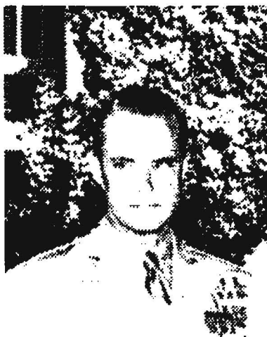
Lieutenant General Hoyt S. Vandenberg STANCIB Chairman

The COMINT organizations would coordinate their activities but would remain totally independent organizations. In addition to the integration of Army-Navy personnel on certain analytic problems, STANCIB divided the Army-Navy responsibility for military and naval targets along the traditional lines and identified the diplomatic and commercial communications as a "joint" responsibility, to be placed under the direction of the new Coordinator of Joint Operations. To implement this new concept of Army and Navy cooperation, STANCIB directed the Chiefs of ASA (Army Security Agency) and OP-20-G to draw up the details of a plan and statements of general principles governing the roles and responsibilities of the services and the Coordinator of Joint Operations. 23