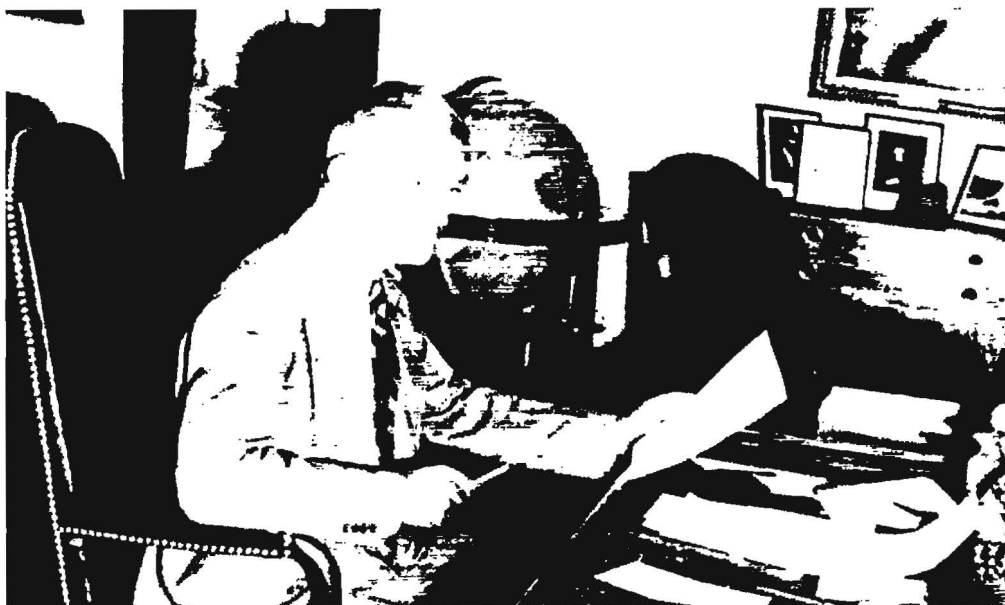
James V. Forrestal, First Secretary of Defense, 1947-1949