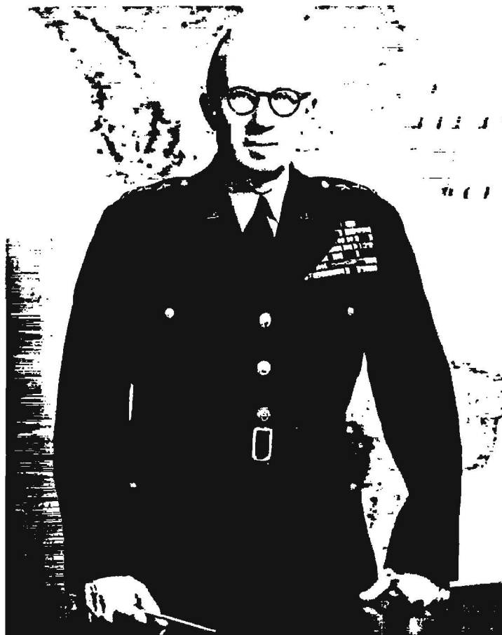
Major General Ralph J. Canine

take issue with some aspects of the report. The committee had proposed an extension of the responsibilities of AFSA to include a communications security responsibility for the entire United States government rather than merely the Department of Defense, as was then the case. Canine agreed in principle with the proposal but pointed out that the committee had included very little on communications security in its report. He recommended that the proposed directive be confined to COMINT, with communications security to be made the subject of another study and to be addressed in a separate directive. Canine also argued strongly against retention of the rule of unanimity – even for COMINT matters outside the jurisdiction of AFSA. He pointed out that this would only serve to perpetuate one of the chief difficulties that had hampered USCIB in the past. He urged the acceptance of a majority-rule principle to govern all USCIB decisions. Lastly, Canine pointed out that the Brownell Report had omitted the generally accepted