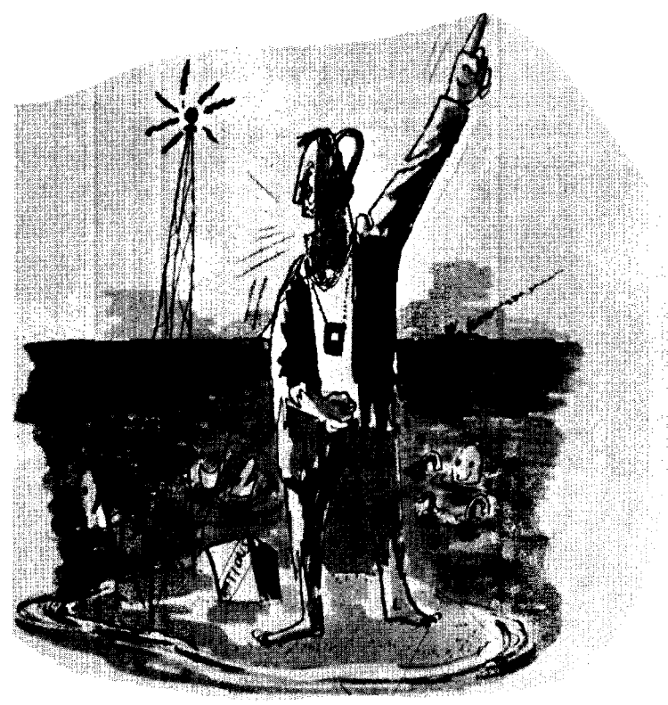
FOR OFFICIAL USE ONLY