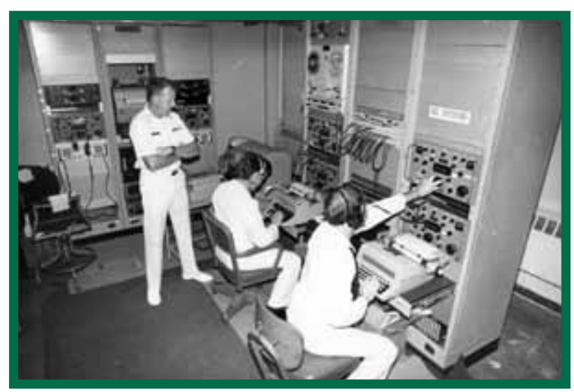
Naval Reserve chief petty officer supervises training of R-390 operators.

Vietnam had highlighted glaring COMSEC problems in all the armed services, so the program's effort to increase COMSEC effectiveness for the active Navy was well timed. Some 1966 experiments conducted by several NSGR units to assess the possibilities offered by the COMSEC monitoring mission led to formal plans of action. In March