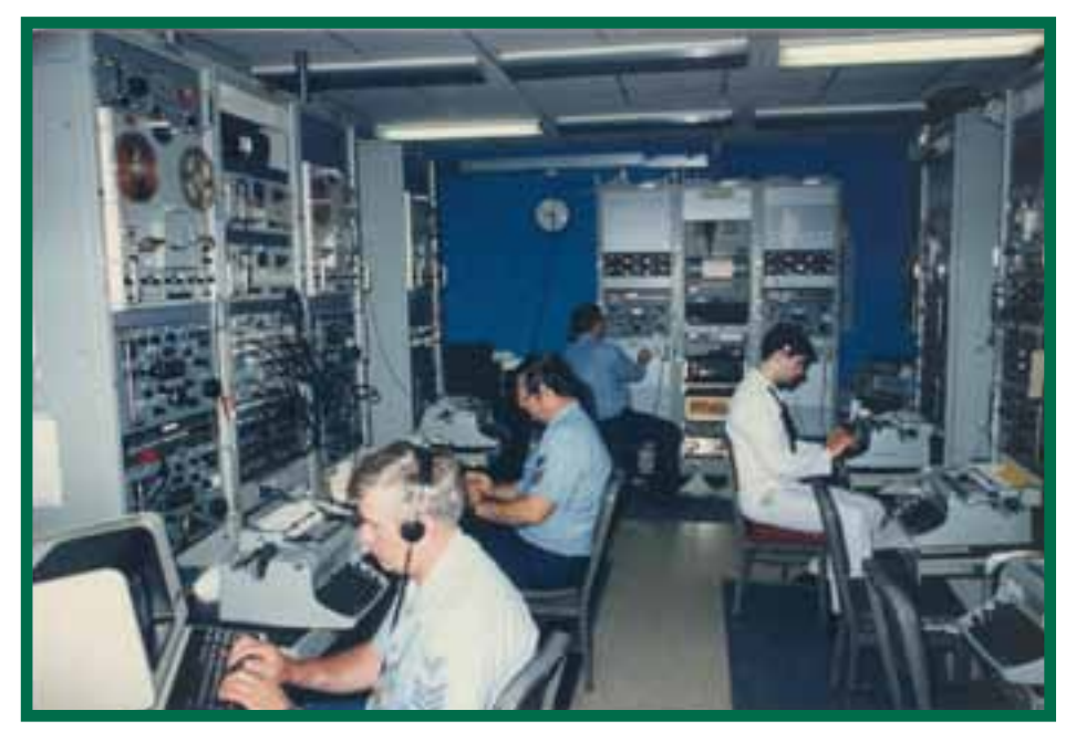
NSGR training suite

In addition to training, which was in the hands of the small group of experienced personnel known as "cadre" in most units, much reservist time was spent on recruiting and screening new members. The NSGR received a regular influx of personnel coming off active duty, yet it is evident that by the late 1950s the program had drifted from its operational aspirations and was becoming mired in routine, with too much training and administrative work and not enough real-world activities. Few reservists were assigned any specific wartime mission. The large-scale growth in the active duty Naval Security Group during this period was not