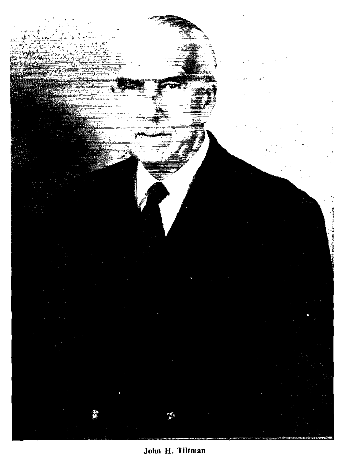
25 May 1894 – 10 August 1982