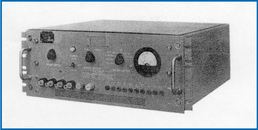
Fig. 1. TSEC/HW-8, Transmission Delay Compensator

restart coordination with the sending station. NSA and the Navy purchased approximately 450 HW-8s.