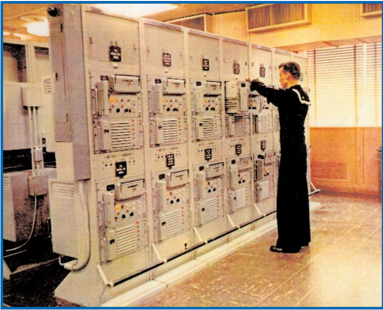
Fig. 3. The KW-26 in operation

When the last days of the first KW-26 became apparent, TCOM sent the first units to the NSA archives for historical preservation. The parting words of the principal TCOM transmission system engineer: