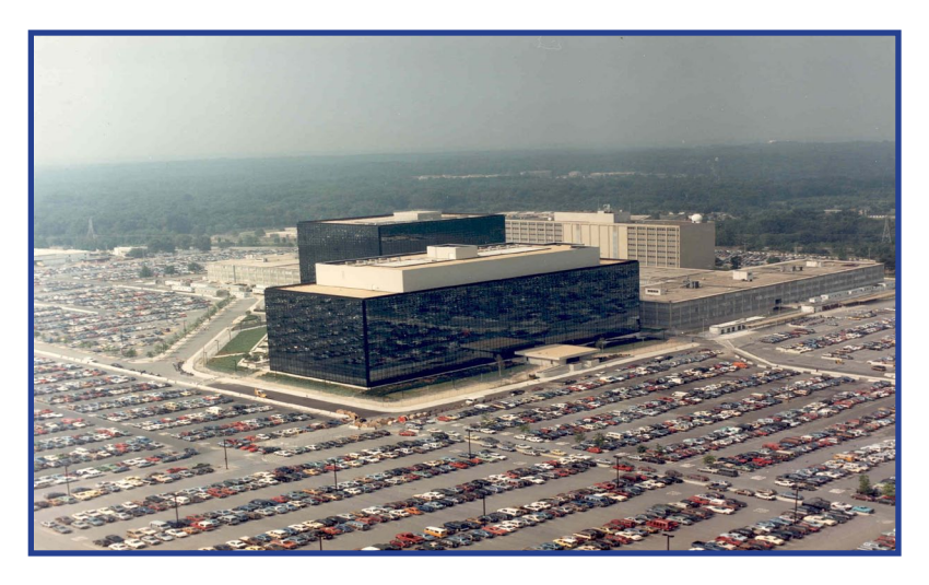
DEFSMAC is located within these NSA facilities at Fort George G. Meade, Maryland.

DEFSMAC is located at NSA Headquarters at Fort George G. Meade, Maryland, and has been in operation 24 hours a day, 365 days a year, for almost 50 years.