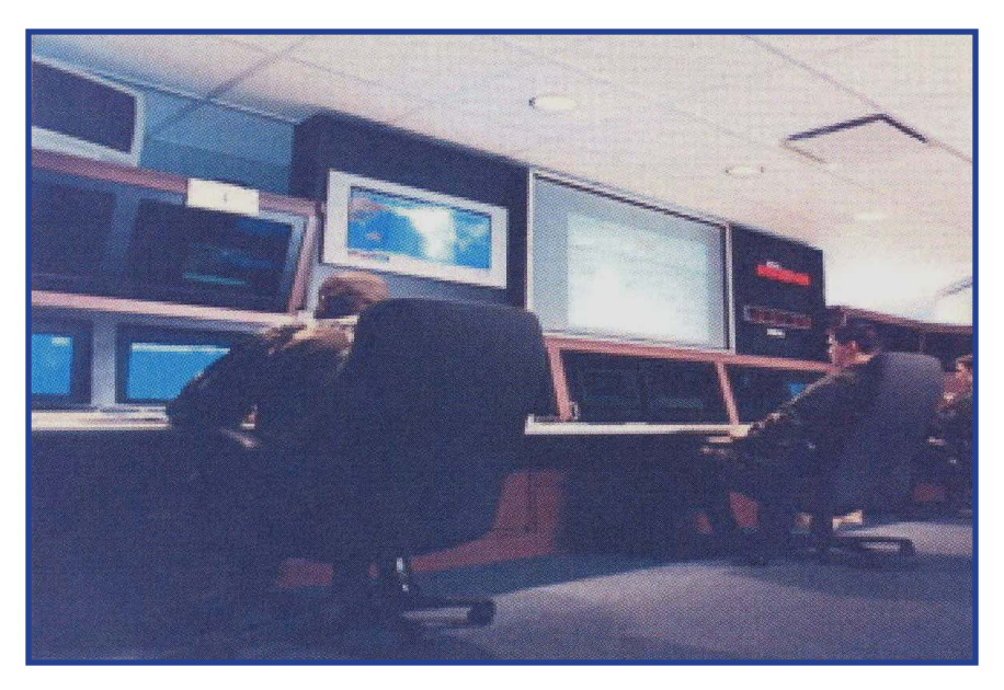
The new location included modern computer console workstations, equipment, and extensive interactive databases and computer resources.

By the early 1990s DEFSMAC had once again outgrown the space and facilities available to operate the Center. A completely new facility was planned and implemented with the added constraint of maintaining the twenty-four-hour-a-day operation without any disruption in capability. The modernization of the Center was completed and put into operation, still within NSA facilities at Fort George G. Meade. The upgrade also provided increased and improved worldwide communications access to collectors and customers as well as major additions to the computer and database assets essential to managing the operation.