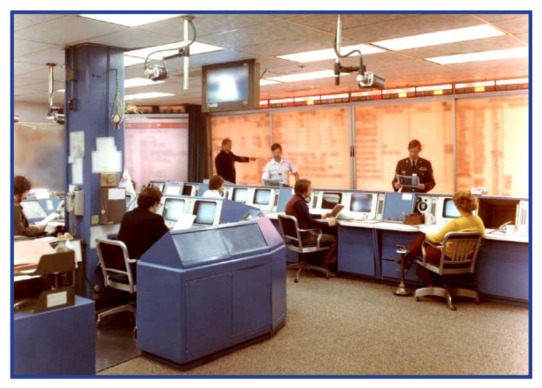
Operations Watch Area after modernization with improved computer screen displays