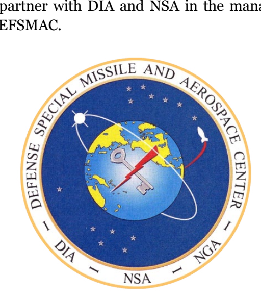
The 2010 DEFSMAC seal showing the DIA, NSA, and NGA partnership

2010 — The National Geospatial-Intelligence Agency (NGA) became a full partner with DIA and NSA in the management and operation of DEFSMAC.