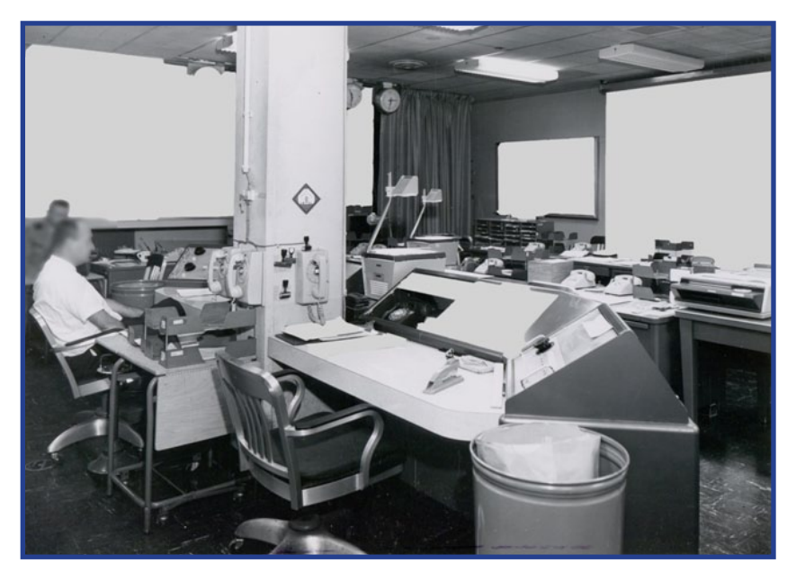
The 24-hour-a-day Watch Operations Area at NSA in June of 1964

After DEFSMAC was established by the April 1964 DoD Directive, NSA moved quickly to find a suitable location at the NSA complex at Fort George G. Meade, MD. The NSA SMAC operation was relocated, space was added for the DIA personnel who were assigned to DEFSMAC, and a communications area and a target location work area was designed into the new Center.