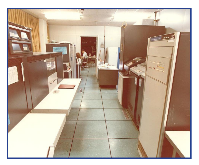
Computer support work area in the late 1970s. Several computer systems that directly supported DEFSMAC were located adjacent to the DEFSMAC operations and analytic work areas.

The Data Systems Development (SY) element provided computer system upgrades and supported current operations and intelligence reporting. SY also assisted other NSA elements as they developed new, or modified, computer systems to support DEFSMAC requirements.