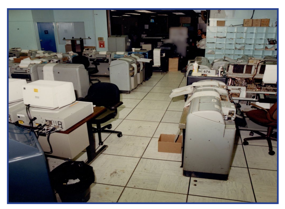
The 1970s-1980s teletype communications to collection locations and customers, still with paper-based operations

The Operations Directorate (OP) coordinated current data collection operations (twenty-four hours a day), collection resources management, and target development.