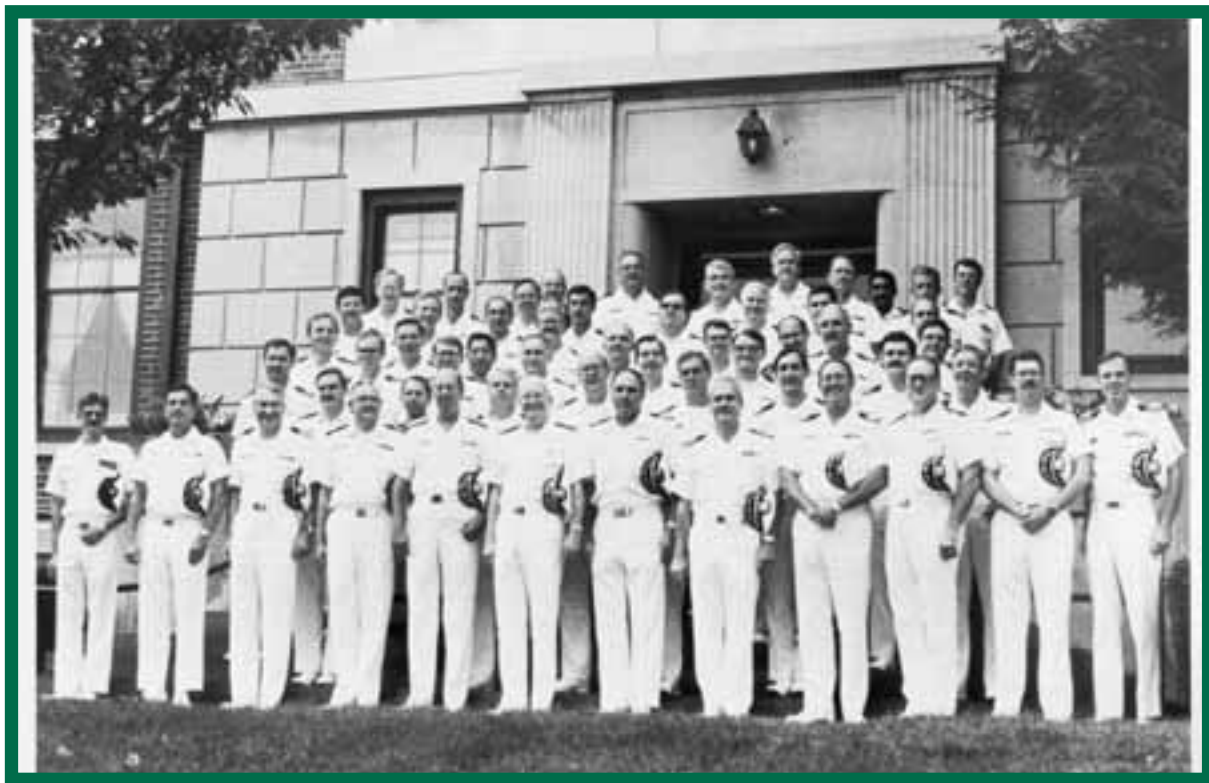
Naval Reserve Security Group leaders from around the nation attended the innovative 1986 Planning Conference in the historic building where Navy cryptologists helped win World War II.