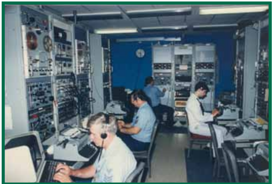
NSGR training suite

In addition to training, which was in the hands of the small group of experienced personnel known as "cadre" in most units, much reservist time was spent on recruiting and screening new members. The NSGR received a regular influx of personnel coming off active duty, yet it is evident that by the late 1950s the program had drifted from its operational aspirations and was becoming mired in routine, with too much training and administrative work and not enough real-world activities. Few reservists were assigned any specific wartime mission. The large-scale growth in the active duty Naval Security Group during this period was not