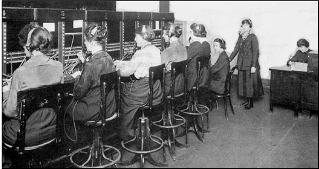
American women serving in France as telephone operators.

One problem was that American soldiers were not experienced operators. By 1917, telephone operating in the United States was women's work, and few, if any, professional male operators existed. 17 Soldiers tried to serve as operators, but they were not motivated or skilled enough to work at the speed required by the army. Further, most U.S. soldiers did not speak French, which was vital since many calls went over French telephone lines. At the same time, the French operators hired by the AEF were no more successful. Many of the French women did not speak English well, and their work speed was much slower than that expected in the United States. 18 With the French telephone system chronically short of operators, these women probably had little more experience than the American soldiers. After a great deal of frustration, the realized that there was only one solution