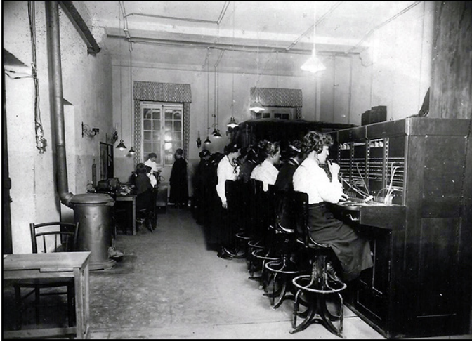
Women operators at the switchboard in the Office of the Chief Signal Officer at the American Expeditionary Forces headquarters in Tours, France, October 17, 1918. U.S. Army Signal Museum, U.S. Army Women's Museum

better off at home, safely away from the fighting. 11 However, during the American Revolution, civilian women traveled with the Continental Army and state regiments. Often the wives of soldiers, they provided support services vital to the well-being of the soldiers, including nursing, cooking, and washing. Their presence was often controversial, and they were usually not official members or employees of the armed forces. This began to change during the Civil War when the Union Army hired women to care for the sick and wounded when there were too few soldiers to do the job adequately. This lesson was forgotten until the Spanish-American War, when the lack of women nurses during the early part of the conflict cost many American lives. When epidemics of typhoid, yellow fever, and dysentery broke out, the U.S. Army had to scurry to hire professional, female nurses as contract employees to care for the sick soldiers. As a result, the U.S. Army Nurses Corps was established in 1901, and in 1916 army nurses were readily available to care for the sick and wounded during the conflict along the U.S.-Mexican border. Although the nurses lacked full army status and rank, when the United States entered World War I, they were sent to France as members of the AEF. However, further increasing the number of