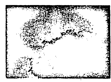
... having just émerged from behind the tree ...