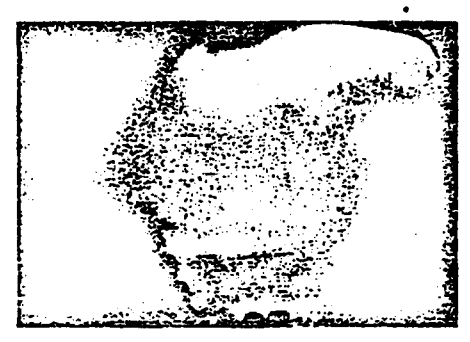
The UFO about to pass behind a nearby tree . . .